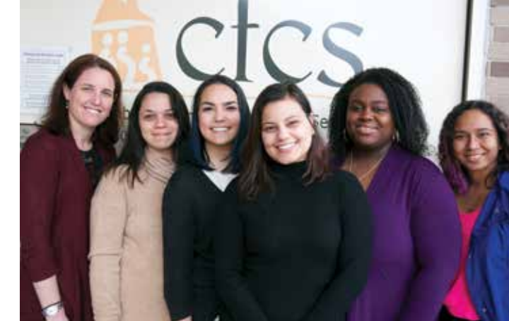
Part of the Family Support & Stabilization team at CFCS

This year, we were excited to be awarded a new contract through DCF to implement a Young Parents Support (YPS) program for 30 parents under the age of 23 living in the City of Boston. We launched this new service March 1st, 2018 and have begun active community outreach, enrolling 11 young parents in our first few months of service.