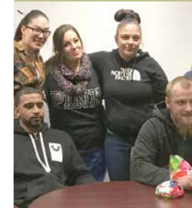
Parenting Journey graduation, January 2018